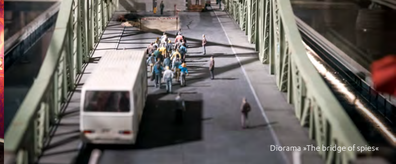
Diorama »The bridge of spies«