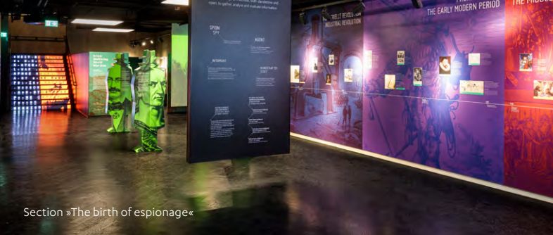
Section »The birth of espionage«

Welcoming over 400,000 visitors every year, the DSM numbers amongst the top 10 of Berlin's most-visited museums