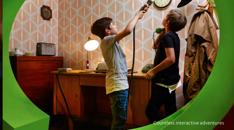
Countless interactive adventures