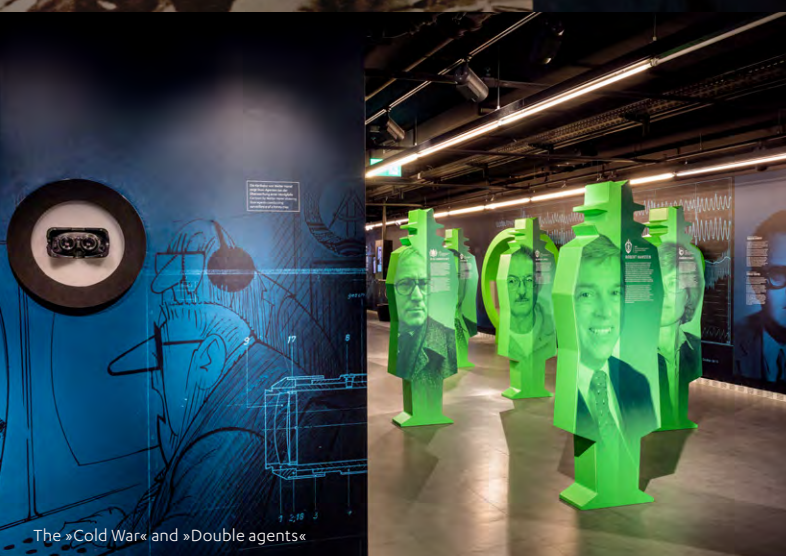
The »Cold War« and »Double agents«