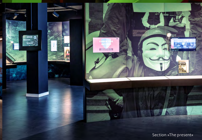
Section »The present«