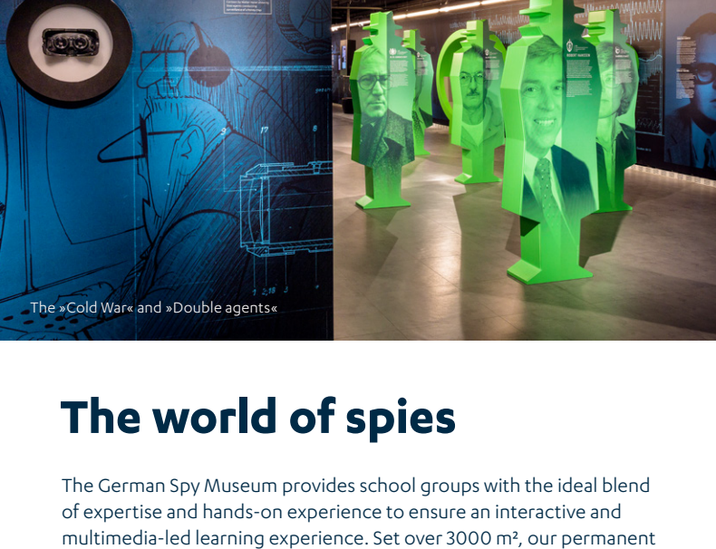
The »Cold War« and »Double agents«