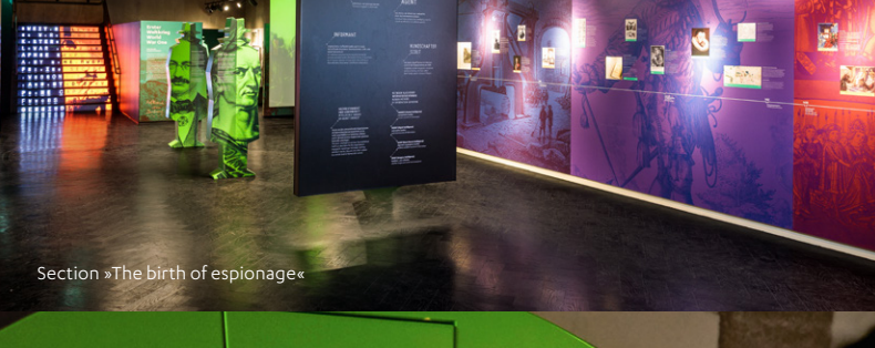
Section »The birth of espionage«

Welcoming over 400,000 visitors every year, the DSM numbers amongst the top 10 of Berlin's most-visited museums