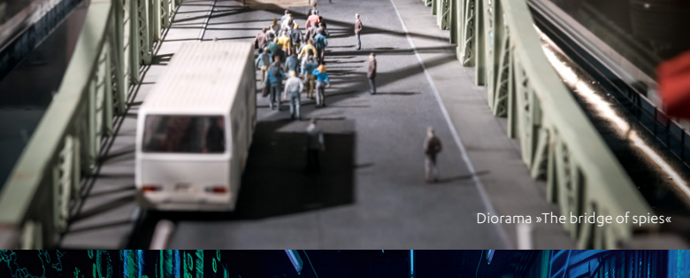
Diorama »The bridge of spies«