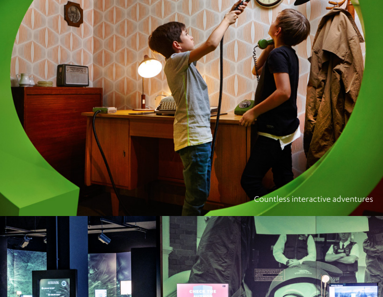
Countless interactive adventures