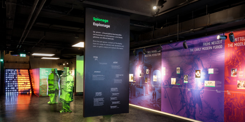
Section »The birth of espionage«

Welcoming over 400,000 visitors every year, the DSM numbers amongst the top 10 of Berlin's most-visited museums