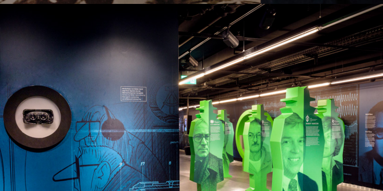
The »Cold War« and »Double agents«