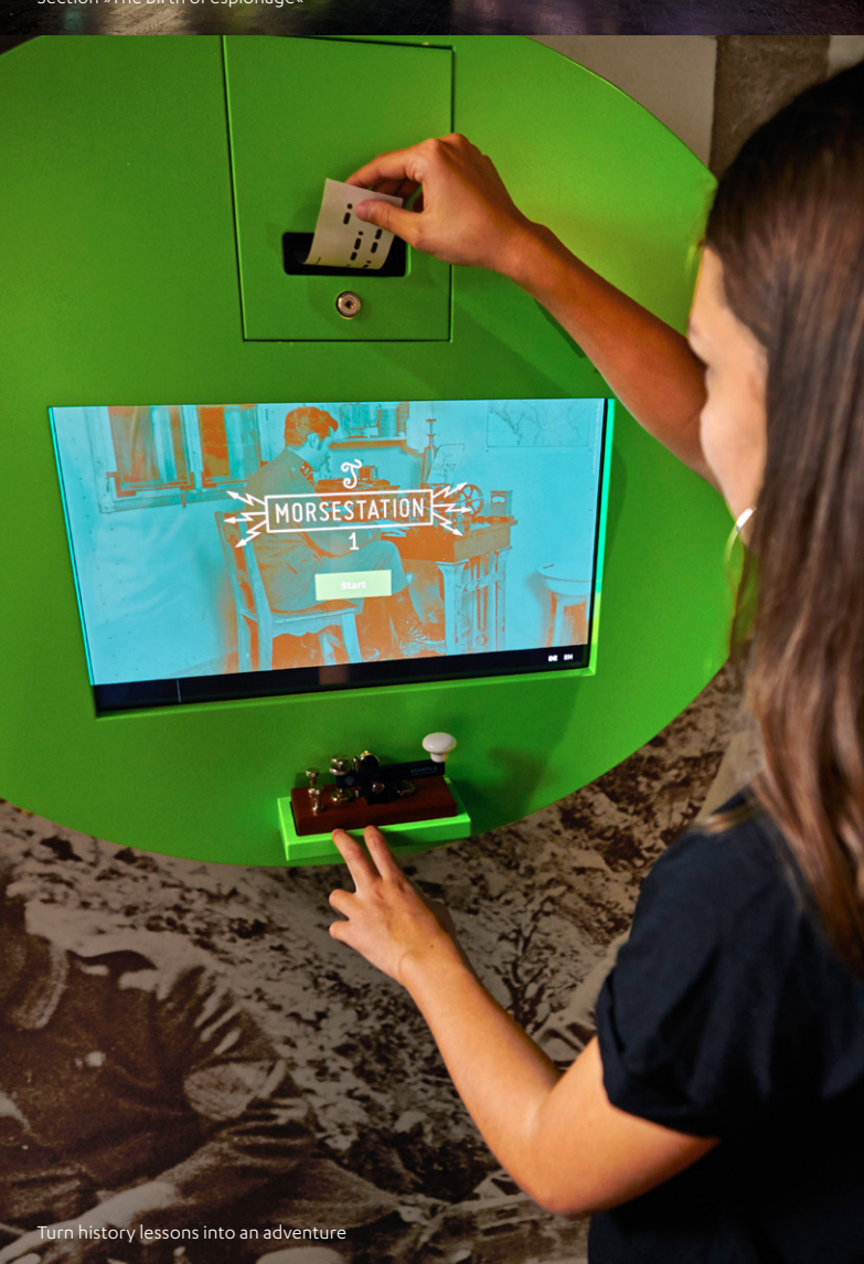
Turn history lessons into an adventure