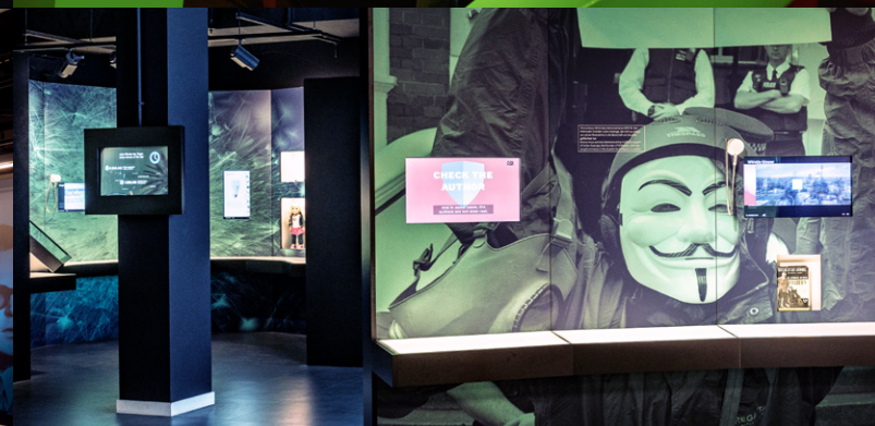
Countless interactive adventures