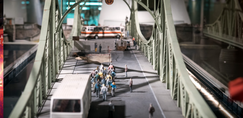
Diorama »The bridge of spies«