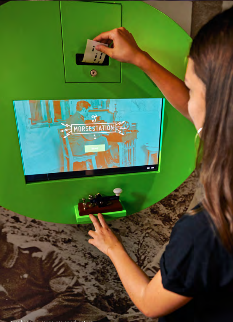
Turn history lessons into an adventure