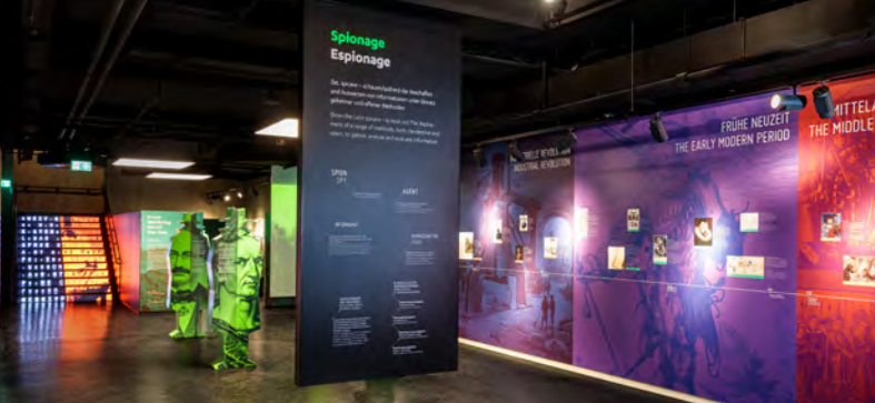
Section »The birth of espionage«

Welcoming over 400,000 visitors every year, the DSM numbers amongst the top 10 of Berlin's most-visited museums