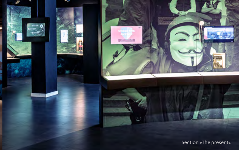
Section »The present«