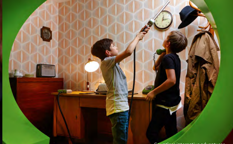
Countless interactive adventures