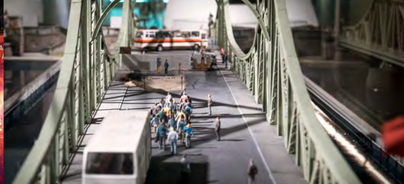
Diorama »The bridge of spies«