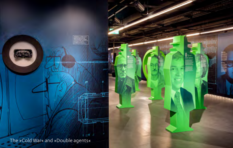
The »Cold War« and »Double agents«