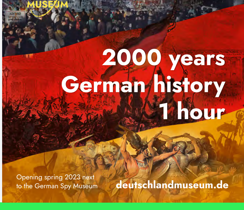
Opening spring 2023 next to the German Spy Museum